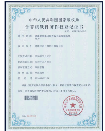
Analog display system patent