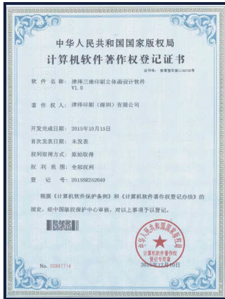
3D printing 3D patent