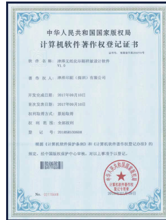
Paperless printing template design patent